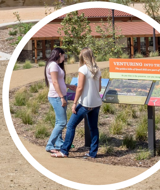
City of Irvine Quail Hill Community Park