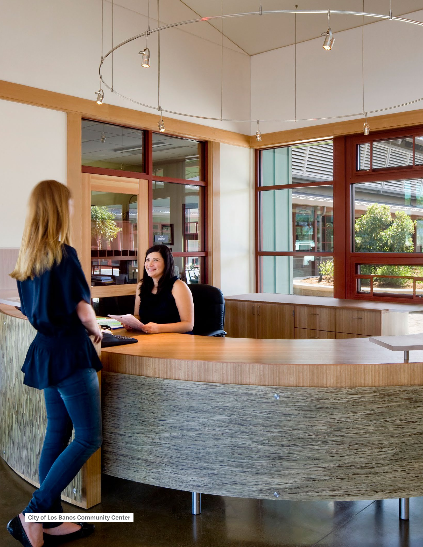
City of Los Banos Community Center